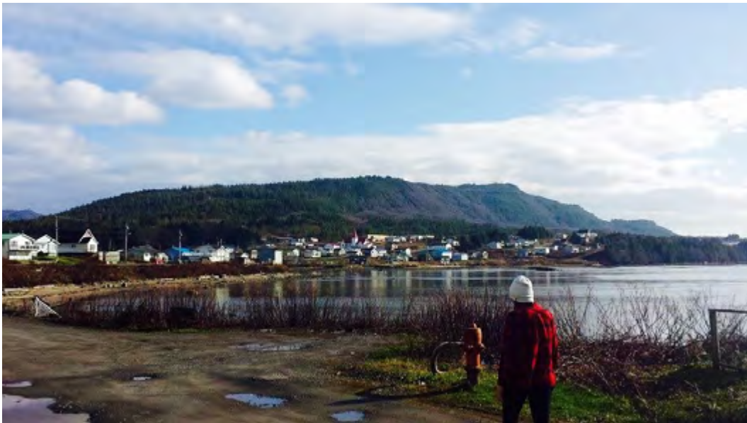
Community of Lax Kw'alaams, BC. A BSW 4th year student went on practicum with an Aboriginal organization on the ancestral territories of the Tsimshian Nation in Prince Rupert.