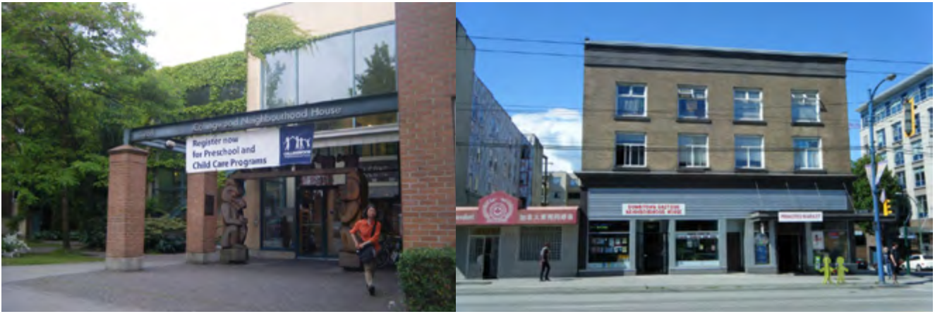
Left: Collingwood Neighbourhood House; right: Downtown Eastside Neighbourhood House.

individual and focus group interviews of approximately 200 people. Currently, the project team is working with their community partners to creatively disseminate their findings to different stakeholders in the community.