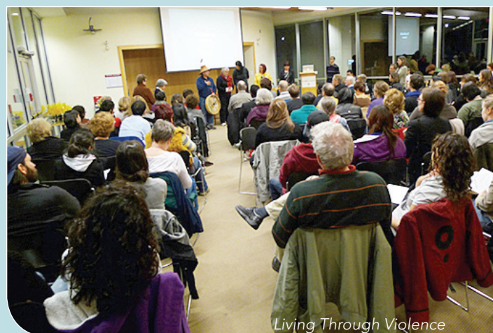
Living Through Violence