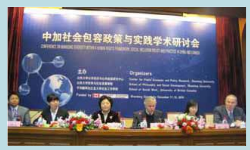
Chinese Delegation, Shandong University

the social cost of rapid economic growth and we are excited about the possibility of working with them over the coming years as they develop the Social Work profession and social service sector in China. We had the opportunity to visit a number of agencies and were impressed by the dedication and commitment of those we met. I hope we can over